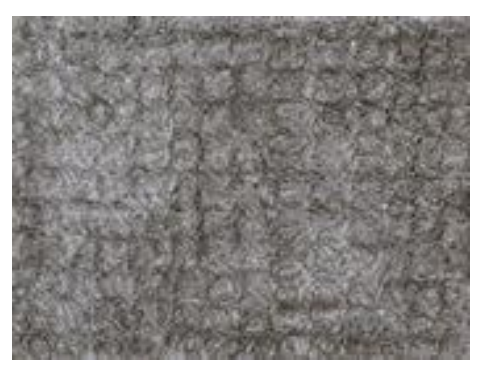
Ocean of Horror

The night after I suddenly woke up. Within a split second I was thrown into a Dark Ocean of Limitless Horror. The very immediate, direct and timeless anguish was both within and around me. At the selfsame moment the body was "decomposing". My "aura", emotions, feelings and thoughts had all disappeared, together with my sense of identity. Moreover, a terrible smell of decay penetrated me, together with a flash in which worms were consuming my body. Deep within, there were waves of deepest ice-cold electricity. My old self - bodymind - had completely gone.