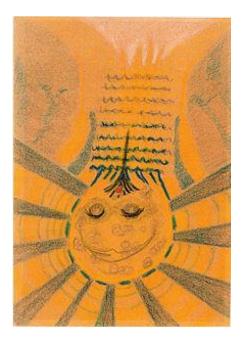
His attempt to express what happens in his head.....

When awareness and the straight posture once again completely coincide and one is above all conscious of the centre of the lowermost part of the spine, there often proves to be additional energy which then contracts in a circle on the crown of the head. In this state a contracted, forceful field of energy is sealed off from the rest of the roof of the skull. It is a centre of aware presence from which everything is viewed. All that was beneath it has now been released and has become completely transparent, open and free.