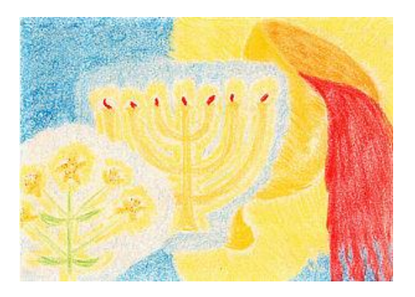
St.John's Wort, Menorha, Chalice

Because of the length of the page, I have put this text elswhere. Please, click "Vision of the Grail"